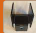
Bottom Rail Angle Bracket