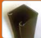
Post Galvanized/ Powder Coated