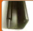
Top/Bottom Rail Galvanized/ Powder Coated