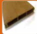
Fence Board 6" x .875"