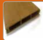
Fence Board 6" x .875"