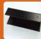
Post and Rail Cap