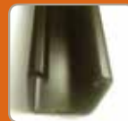
Top/Bottom Rail Galvanized/ Powder Coated