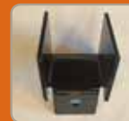
Bottom Rail Angle Bracket