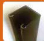
Post Galvanized/ Powder Coated